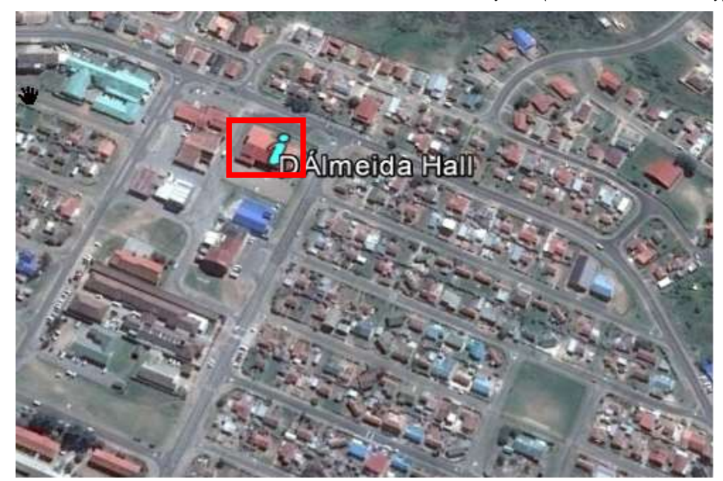
GPS : 34°10'29.884"S 22°07'05.881"E - D'Almeida Community Hall (D'Almeida, Mossel Bay)

Mossel Bay Municipality requires the services of a professional service provider to establish Wi-Fi Hotspots at the following Community Centres in Mossel Bay Municipal Area: D'Almeida Community Hall, Indoor Sport Centre, Thusong Community Centre, Joe Slovo Community Hall, Benevolent Park Church or School, Great Brak River Youth Centre and Herbertsdale Library.