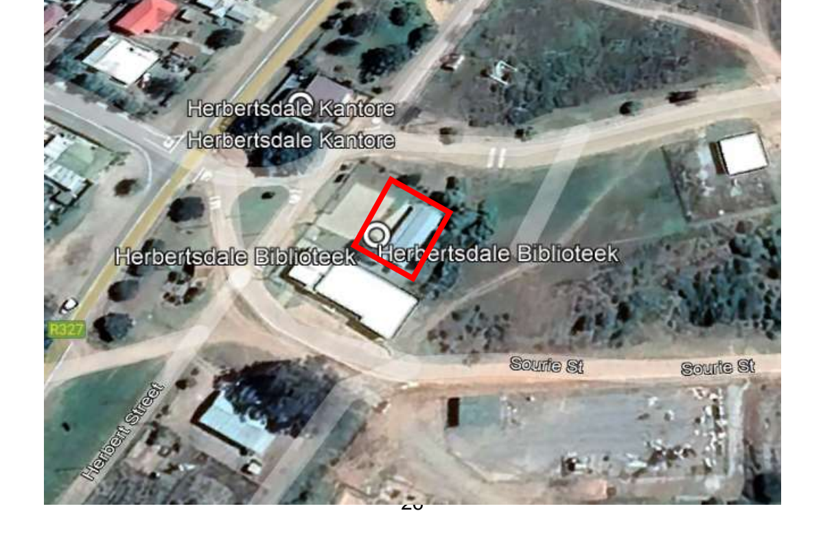
GPS: 34° 1'4.38"S 21°45'43.76"E - Library (Herbetsdale)