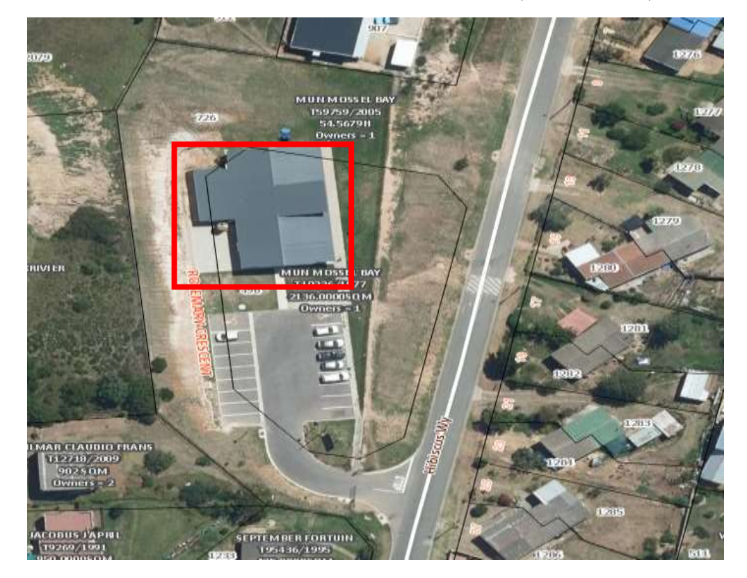
GPS: 34° 02' 20.9385"S 022° 12' 38.9533"E - Youth Centre (Great Brak River)