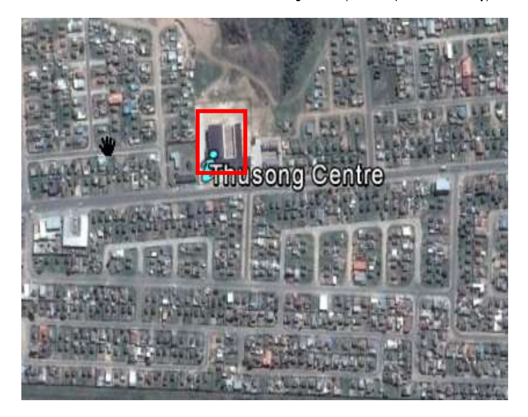
GPS: 34°10'46.207"S 22°04'46.1"E - Thusong Centre (Kwanonqaba, Mossel Bay)

GPS: 34° 10' 42.0944"S 022° 05' 36.2678"E – Indoor Sport Centre (Kwanonqaba)